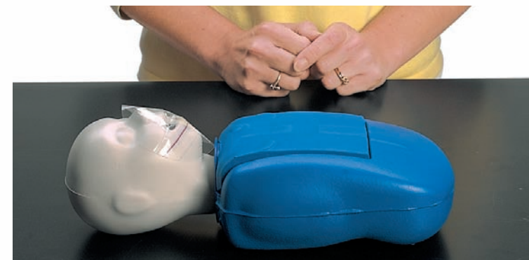
(4.) Infant Manikin is now ready for CPR training and practice.