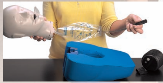
(3.) Insert the insertion tool through the neck and out the mouth; attach Adult/Child lung bag to the insertion tool; pull through mouth and neck.