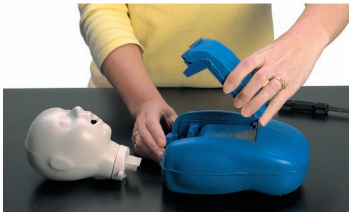
(1.) Remove outer chest plate.