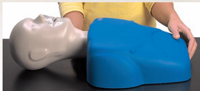
(5.) Adult/Child Manikin is now ready for CPR training and practice.