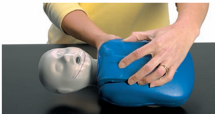
(3.) Slide head into neck brace and snap outer chest plate back into place.