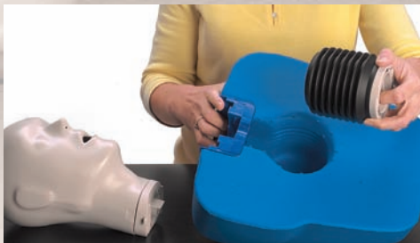
(2.) Remove adjustable chest piston ("clicker").