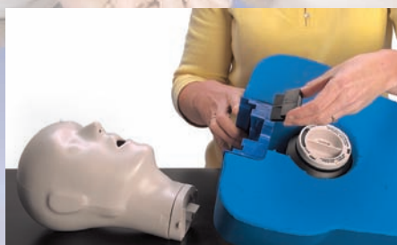
(1.) Remove black neck lock