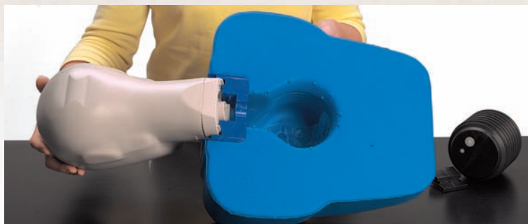
(4.) Pull lung bag through the top of the neck brace; slide head into neck brace; snap the black neck lock back into place; insert the chest piston.